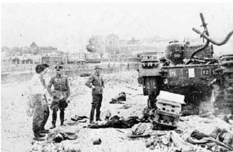
National Archives of Canada C-017293