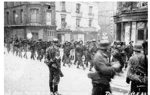
National Archives of Canada PA-200058

On the other side of the room, there is a panel that explains the Raid on Dieppe of August 19, 1942.