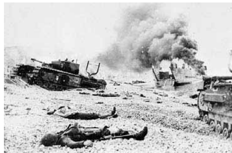
National Archives of Canada C-014160